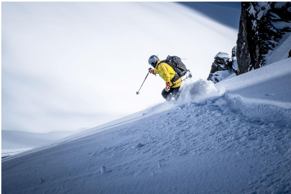
Dominic making some fresh powder turns

On the first day we were split into groups according to experience/skill level. Our group lead by Tom Saxlund immediately discovered some fun fresh powder in between and off to the side of the pisted runs.