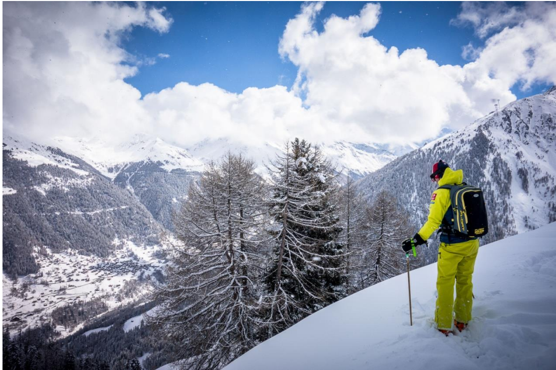
Tom Saxlund about to drop in to some 'challenging' snow

Our group headed over to Zinal for the second day, focussing on technique and carrying out a number of drills. I had my ski technique broken down and built back up again – it was quite an intense day with a lot to remember but I think it started to sink in properly over the next few days. The highlight of the day was a powder descent down to and across the Moiry dam.