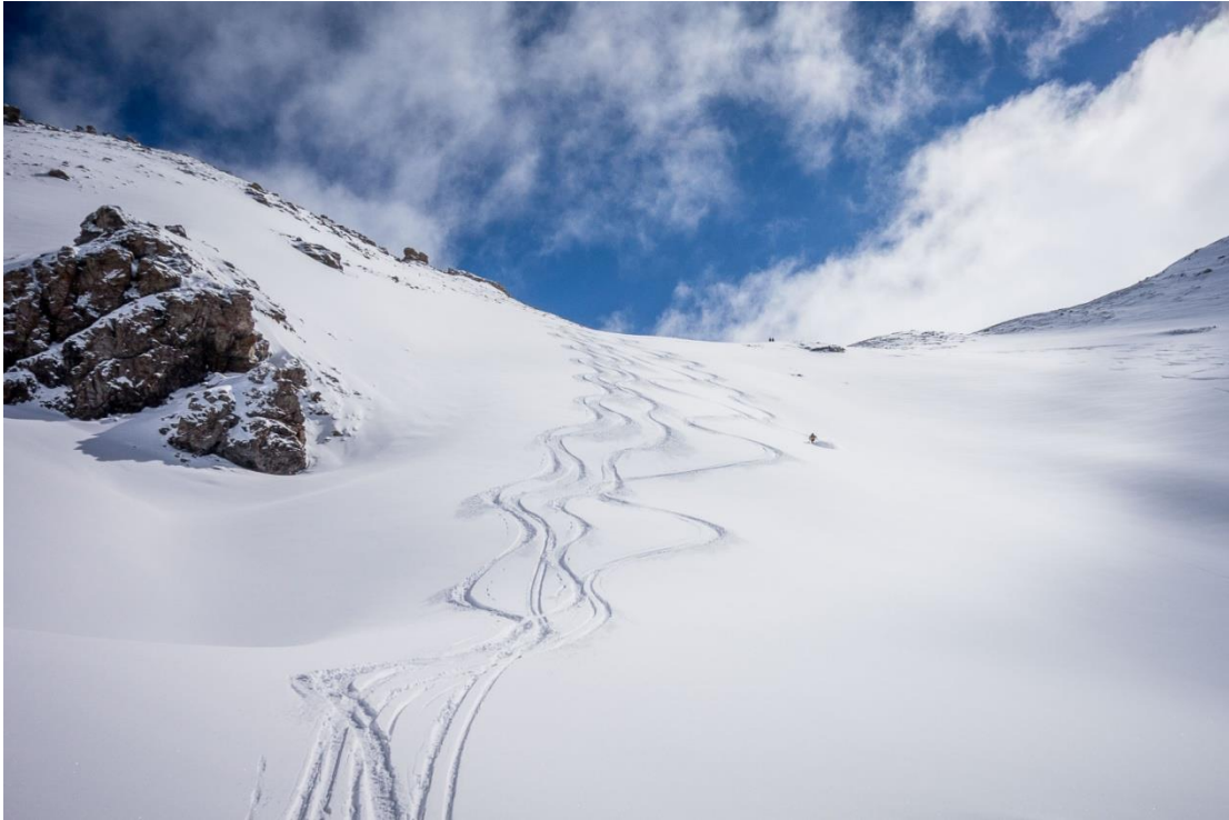
Powder heaven just over the other side from the main ski area

The next day was the group's first bit of 'proper' ski touring of the week, and my first ever. We went out with Graham Frost to the top T-bar then attached skins for a short climb up to teh Col de Louche. The descent down the other side was superb with pitches of wide open totally untracked powder. The rest of the day continued in a similar vein finishing with a nice cold beer in St Jean – my best day on skis so far!