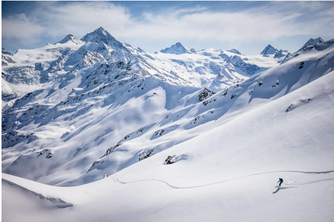
Descent from the Col de Bosson with awesome views to the Moiry glacier