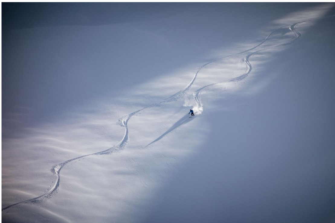
More fresh tracks

All in all it was a fantastic week with sublime conditions, and as a first-time member I was made to feel very welcome and supported.