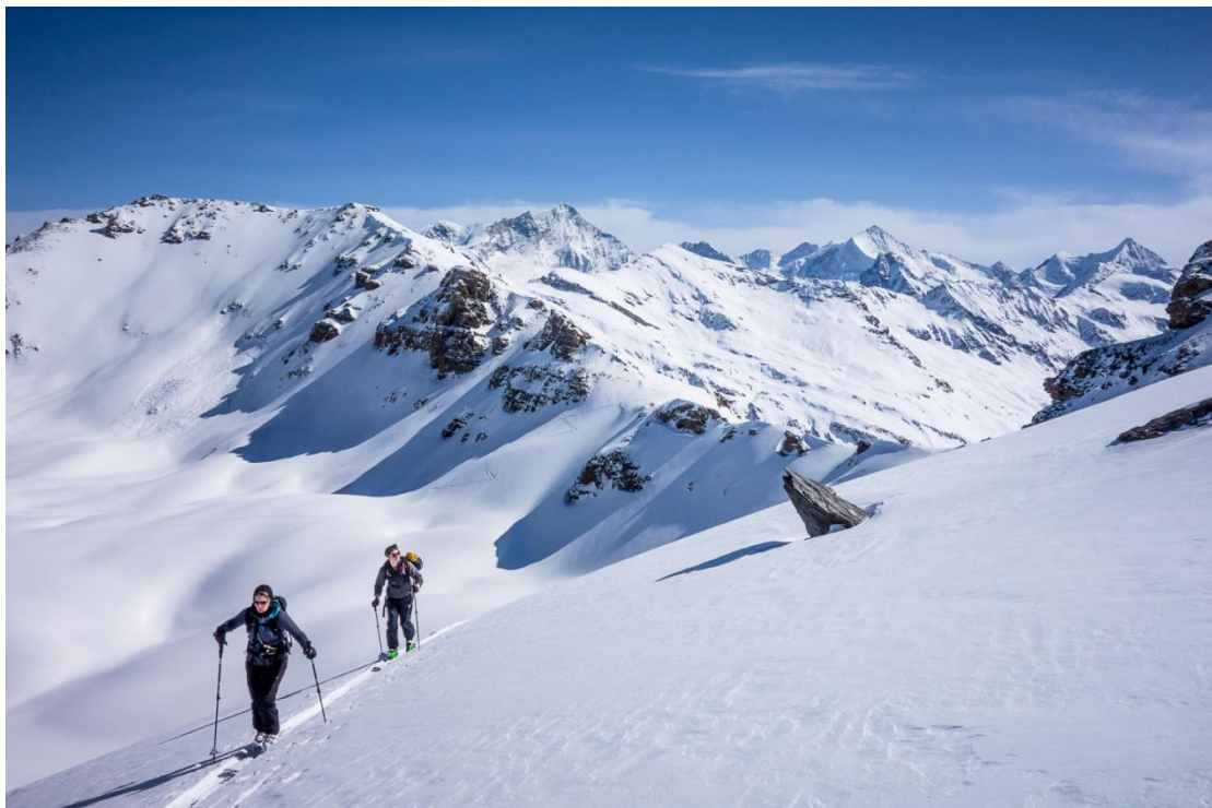
Nearing the top of a long climb

Our last day was with Graham again and was a superb way to finish the week, this time heading up to the Becs de Bosson hut then heading over towards the Moiry dam from the other side. There was a long climb involved but the payoff was more perfect powder with spectacular views of the Moiry glacier behind.